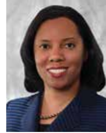
Sabina Matos City Councilperson