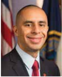
Mayor Jorge O. Elorza